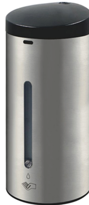
Stainless Steel Housing

Component Hardware reserves the right to make any and all changes and to discontinue any of its products without notice. Not responsible for typographical errors.